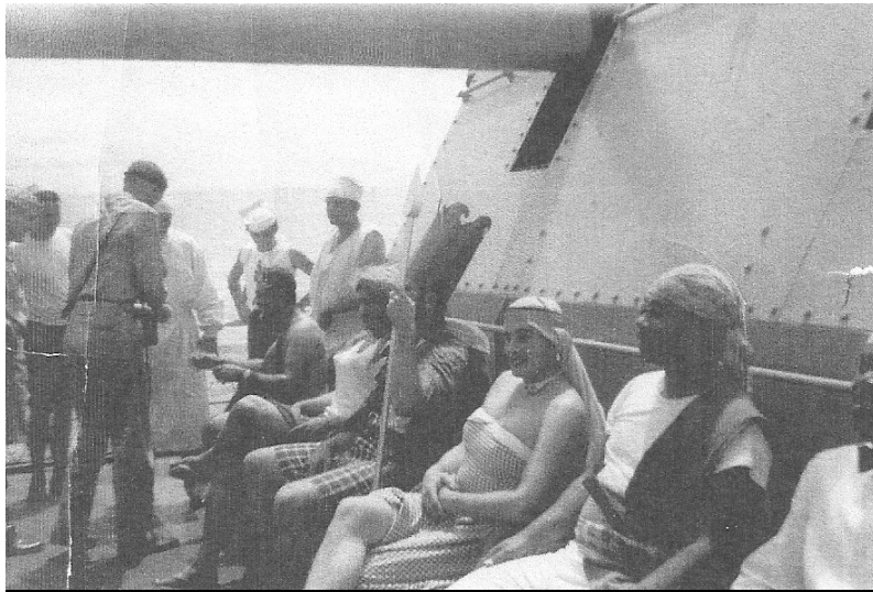
Crossing the Line