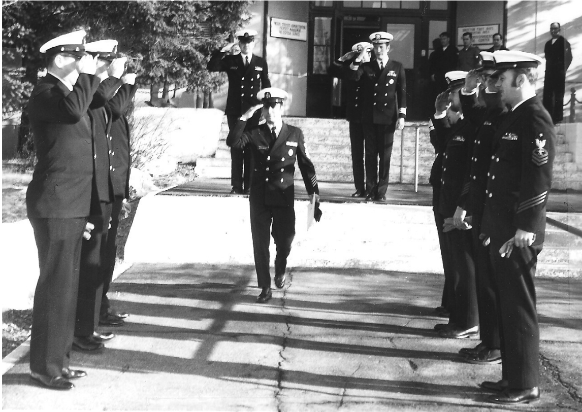
1972 "Piping Over the Side" Navy Correspondence Course Center, Scotia, New York HQ for Recruiting One

Post Navy: 1974-2002, Civil Service, Naval Training Center, Corry Station, Pensacola, FL