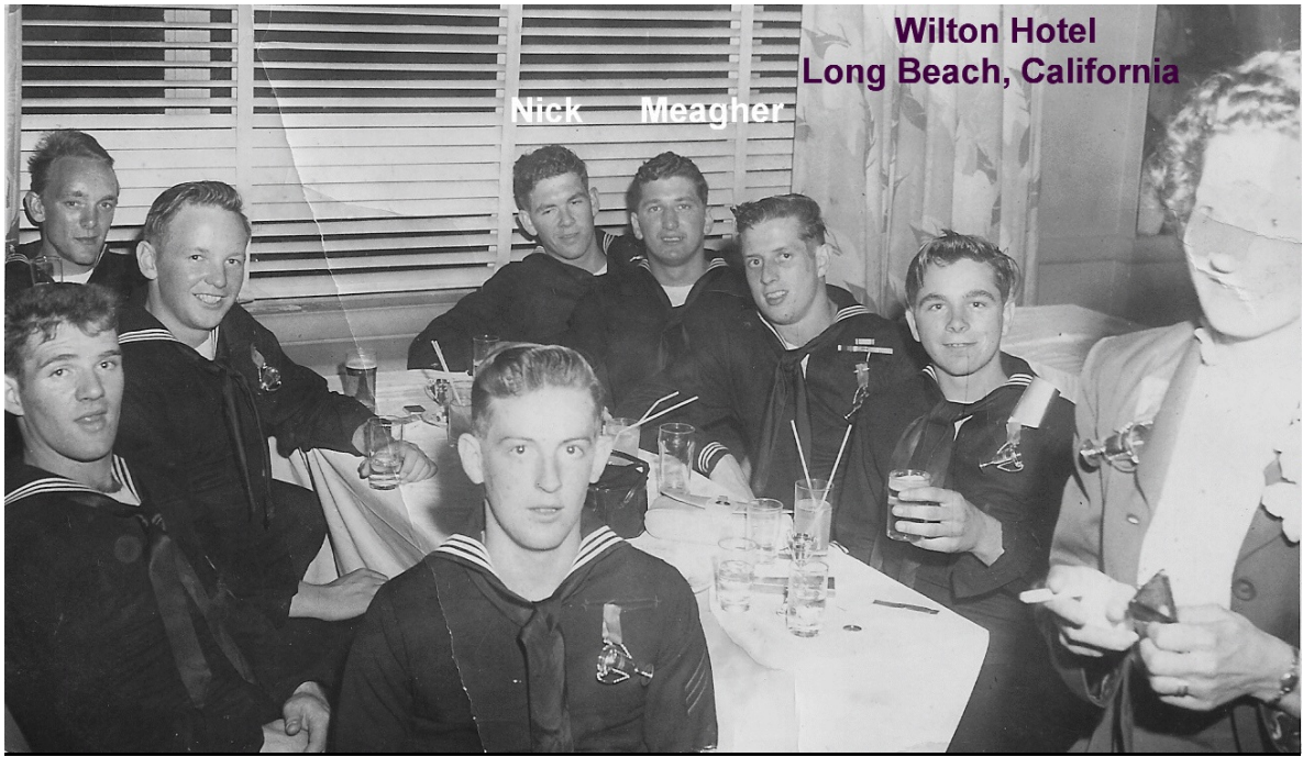
Wilton Hotel Long Beach, California